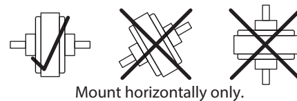
Mount horizontally only.

TORQUE CURVE - Use the lower torque curve when an input current value is approached from 0 amperes. Use the upper torque curve when the input current value is approached from the 100% input current.